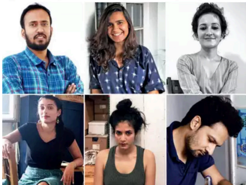
Young artists to watch out for

The Indian art scene is dominated by these dynamic 35 and under, who are pushing boundaries with style and innovation.