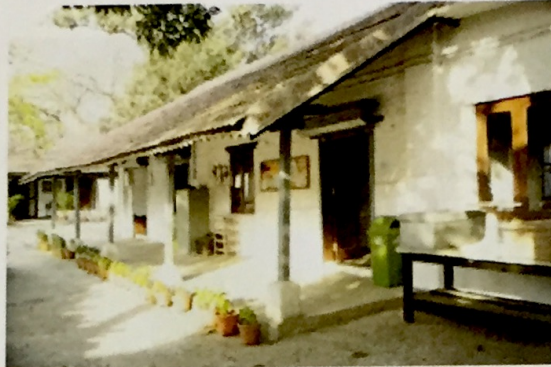
Space 118, in Mumbai

Given the importance that the Québec government attaches to the pursuit of the establishment of lasting cultural ties with India, the Conseil des arts et des lettres du Québec has concluded a two-year partnership agreement with two Mumbai organizations, Space 118 and What About Art? , in order to offer Québec artists an opportunity to become familiar with the incomparable cultural diversity of this Indian megalopolis.