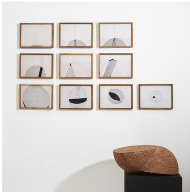
TEJA GAVANKAR TEJA MAHENDRA GAVANKAR, SPHERE 5, BRICK AND CONSTRUCTION MATERIAL, 21" X 15.5" X 9", 2020.

Visitors to the gallery are in for an experience, as these 20 artists give it their all to produce an elementary taste of their work. From Soham Gupta's collage of monochromatic photographs of an almost abandoned town titled Eden Series, to Tarini Sethi's incomprehensibly exquisite piece The Waiting Game; from clay and concrete sculptures and Chinmoyi Patel's Constructions (Arc) – a contemporary piece doused in eye candy abstraction, to Teja Gavankar's untitled collection of ten minimalist pieces ambiguously celebrating the artistic process – All is Not Lost 20:20:20 is art at its most rudimentary level. And put together, it is a war cry.