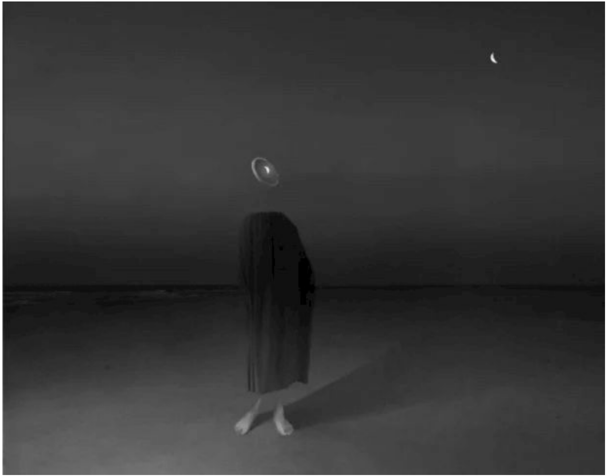
ANIRUDH ACHARYA Untitled II, 2017, Artwork courtesy: @Space118, Saloni Doshi, Image Copyright: @Anirudh Acharya