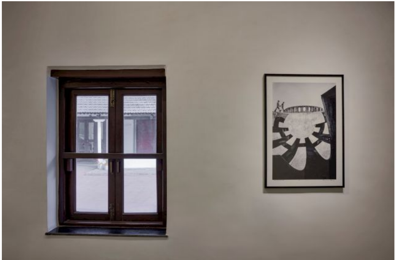
Installation View - Raghu Rai/ Jantar Mantar, Delhi, 1973