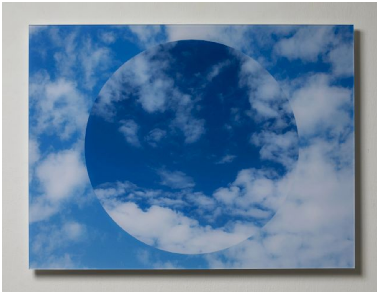
SHILPA GUPTA Half a Sky - 2, 2019, Artwork courtesy: @Saloni Doshi, Space118, Image Copyright: @Shilpa Gupta