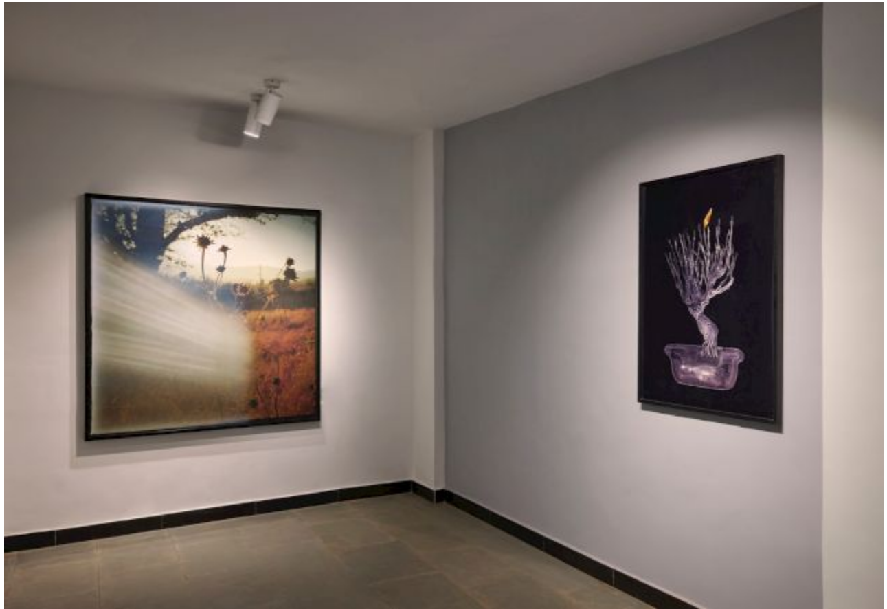
Installation View - Sunhil Sippy/ Oaxaca State, 2020; Neha Choksi/ Lone Orange, 2008, Copyright: The Artist