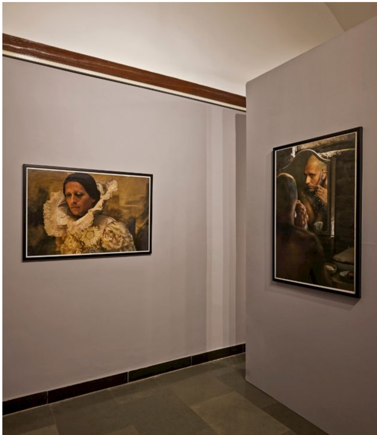
Installation View - Nikhil Chopra/ Untitled 8(From the series/ Yog Raj Chitrakar/ Memory Drawing II), 2008; Nikhil Chopra/ Untitled 8(From the series/ Yog Raj Chitrakar/ Memory Drawing II), 2008, , Copyright: The Artist