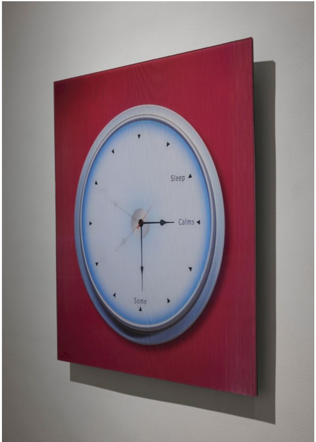
RAQS MEDIA COLLECTIVE 2018, Courtesy: Space 118, Copyright: The Artist