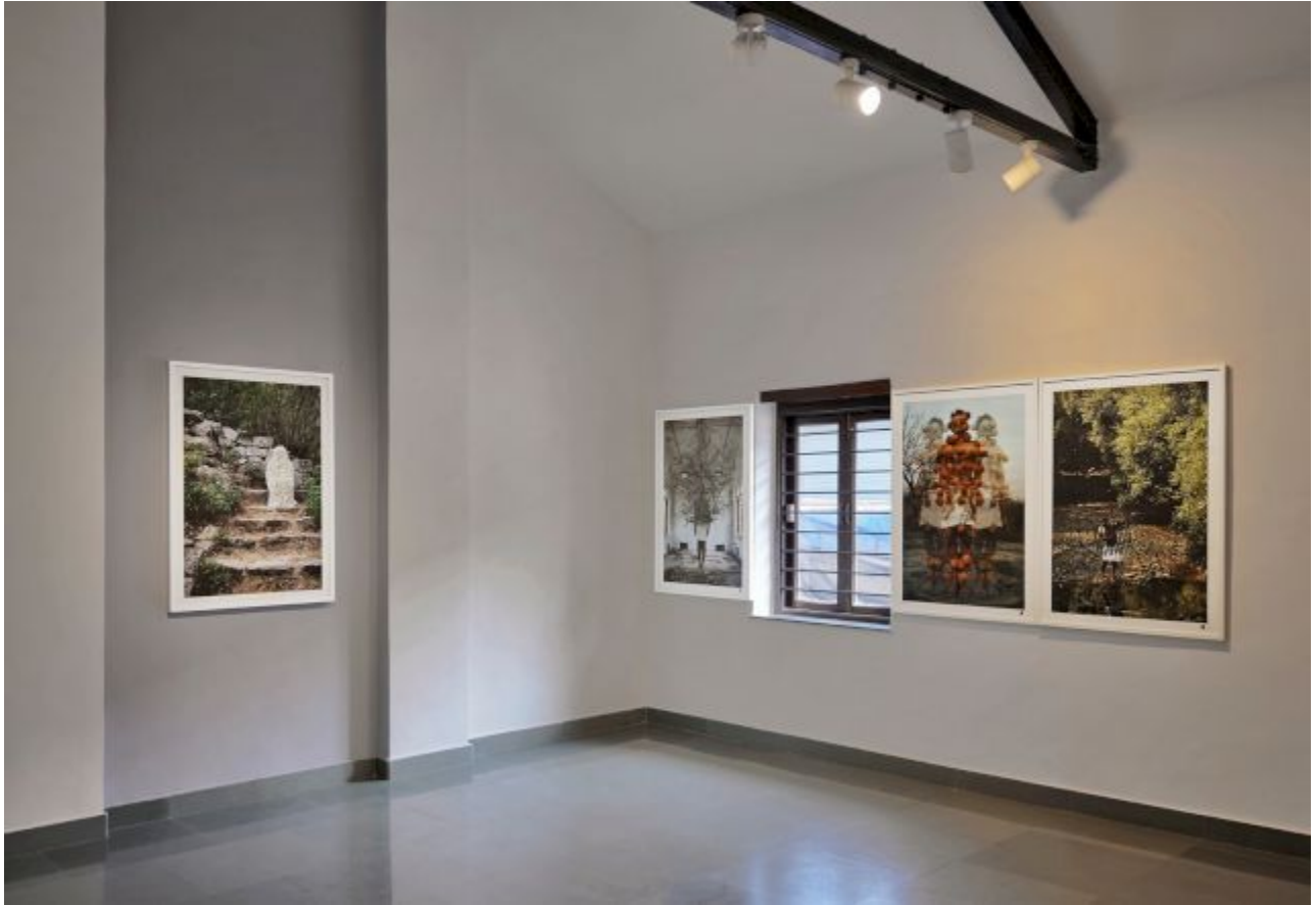
Installation View - Surekha/ Not to be seen – 4, 2008; Madhu Das/ Gifts of the Earth, 2013; Landscape of Confronted Abstraction, 2013; Untitled, 2015, Copyright: The Artist

MADHU DAS Gifts of Earth, 2013, Artwork courtesy: @Saloni Doshi, Space118, Image Copyright: @Madhu Das